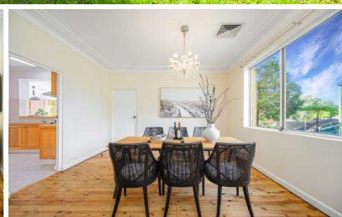
15 Grandview Street Pymble NSW

SOLD! SOLD PRIOR TO AUCTION AT TOP PRICE!