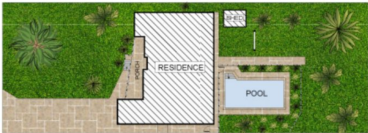
SITE PLAN ( NOT TO SCALE )