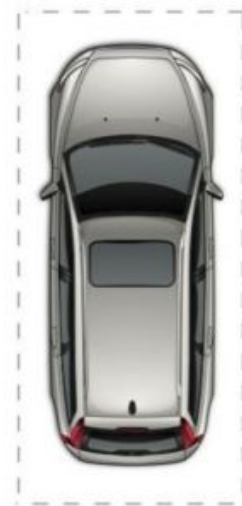
Secure Car Space (13 sqm)