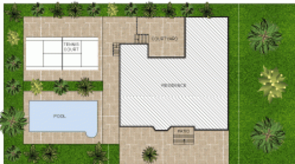
3RD FLOOR (NOT TO SCALE)