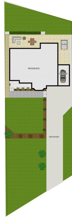
SITE PLAN (NOT SCALE)