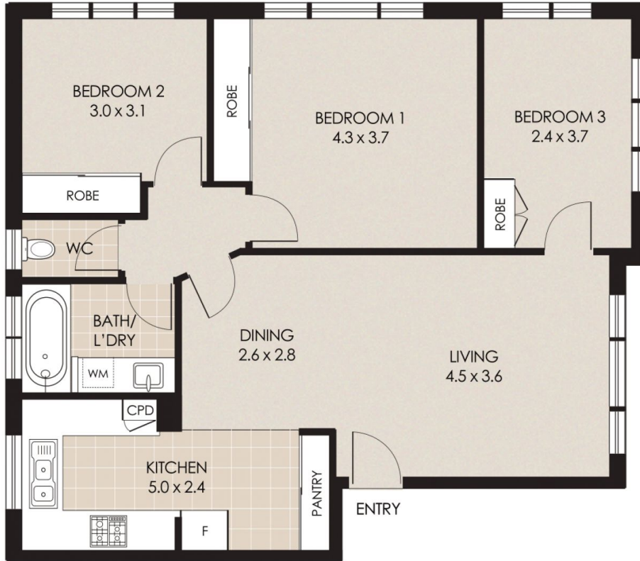
APARTMENT FLOOR PLAN